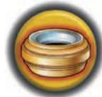
Titanium Nitride-Coated Chromium Cobalt Seaming Rolls