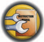
Tool Kit & Instruction Manual