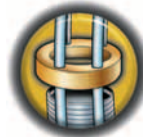
Single Roll Cover Separator