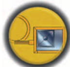
Filler Connecting Parts