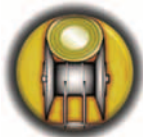
Magnetic Downstacker Chute with Vibrator