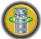
Head Spin Machine