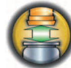
Mechanical Driven Machine Height